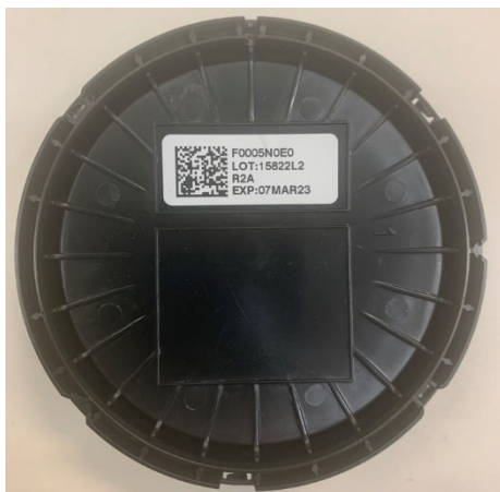
Bottom of cassette: