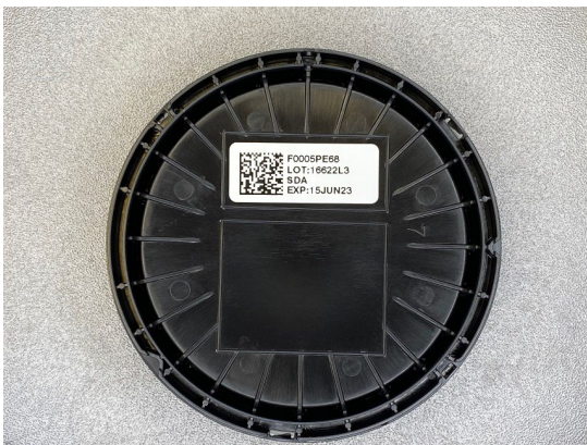
Bottom of cassette: