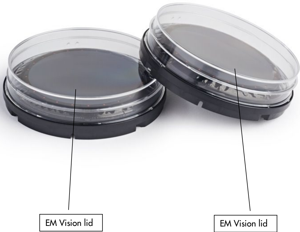
EM Vision lid